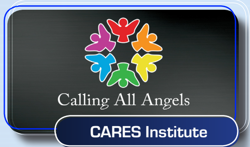
Calling All Angels

Media Imagery is pleased to announce its alliance with Centropy Group which will focus on the development and production of live, streaming webinars offered on a subscription basis. MI was also pleased to join dozens of the region's top companies in supporting the CARES Institute at UMDNJ by producing fund-raising media and social media content for the Calling All Angels Gala held October 9.